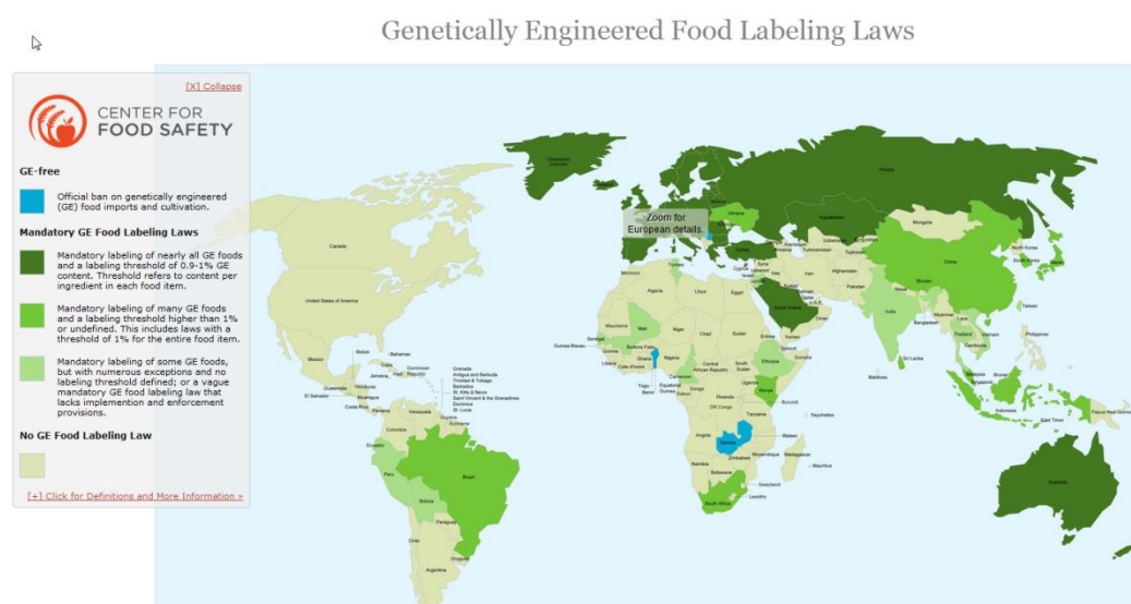
Figure 1: A map showing the different status of labelling laws on GM food in the world.

Since the outset, the application of GMOs in the food sector has been particularly controversial. Within a country, actors such as scholars, politicians, entrepreneurs, scientists, environmental NGOs, consumers, farmers and so forth have expressed different opinions towards it. Meanwhile, a horizontal look at the different parts of the world shows how the issue is being taken up differently: Figure 1 shows the official status of GM food labelling laws in all countries in 2013. Interestingly, while there is no GM food labelling law in North America, all countries in the EU require the mandatory labelling of nearly all GM food with a very low threshold of 0.9-1% GM content. The difference between these two strongest economies is striking, leading to continuous inter-continental trade disputes. Also, focusing on the EU, figure 2 shows a number of sub-regions, among them the nine municipalities in Austria, have declared themselves to be “GMO-free” and expressed their commitment to ban the use of GMOs on their territory. Although a “GMO-free” position as such is decided at the local government level and thus does not stand for a country’s official GM status, these strong anti-GMO voices are nevertheless always taken into consideration in official decision-making processes. All in all, the divergent management of GM food in the world manifests the extreme complexity of this topic.